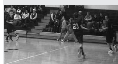
The 8th graders are warming for their game at Sigourney on Wed., Jan. 22.