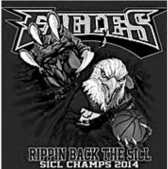
Pictured is the front of the t-shirt for the KHS Boys' Basketball 2014 SICL Champs.