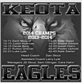
Pictured is the back of the KHS Boys SICL t-shirt.