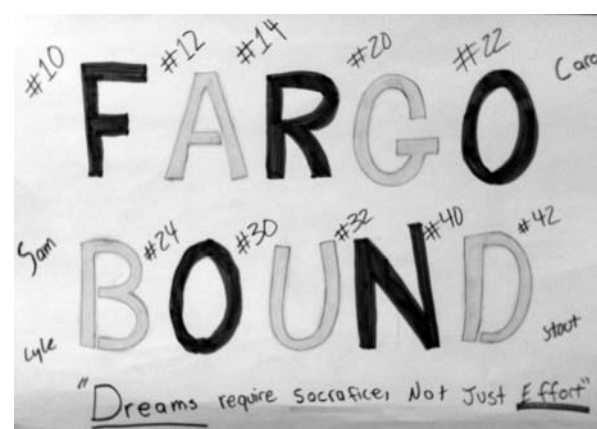
The KHS Eagles are Fargo Bound! Poster by John Mather "Dreams require sacrifices, not just effort"