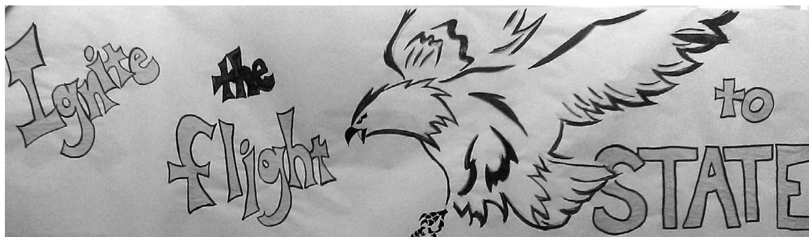
The Keota Eagle Basketball Team is heading to the State Tournament for the second time in Keota's history. The last time was in 1989, 25 years ago. The KHS cheerleaders made the above poster to support the boys going to State.