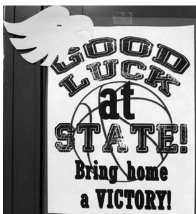
The cheerleaders made locker posters to get the boys pumped up for Monday's game.