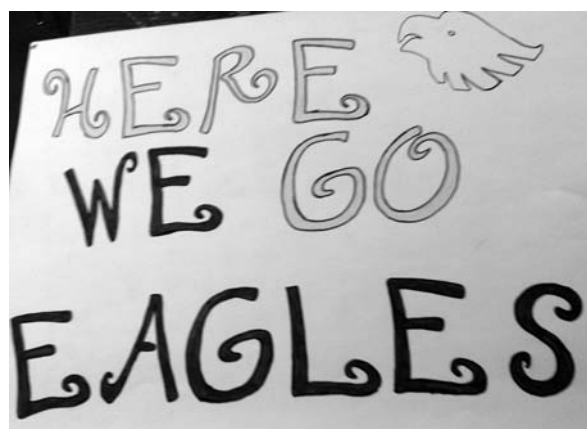
HERE WE GO EAGLES! HERE WE GO! Poster made by Maitland Sieren