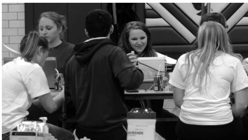
After donating blood at the KHS Blood Drive on Mon., March 17, the brave volunteers enjoyed cookies and pop brought in by the Chemistry students.