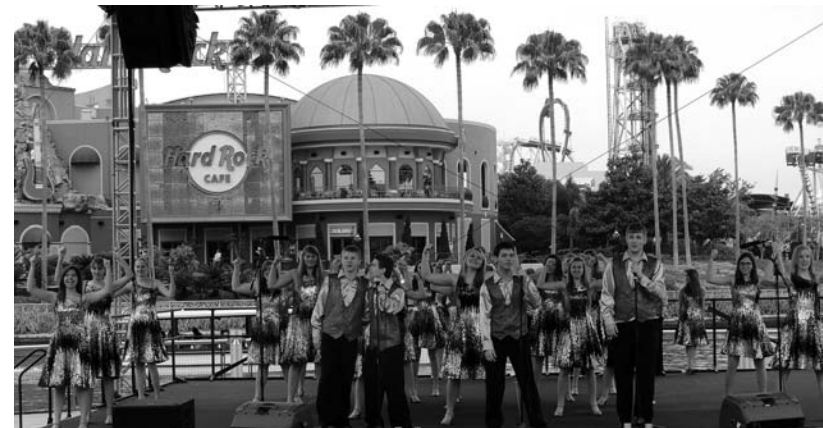
Pictured is EagleRock! performing at Universal Studios on Thurs., March 27. The group performed at the entrance to Universal Studios, with palm trees and the Hard Rock Cafe setting the scene in the background.

On the flight home, everyone was tired, but happy with all the memories of the new experiences they had!