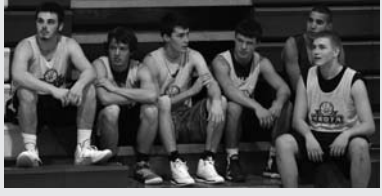
The Varsity boys cheer on the 9th and 10th grade boys.