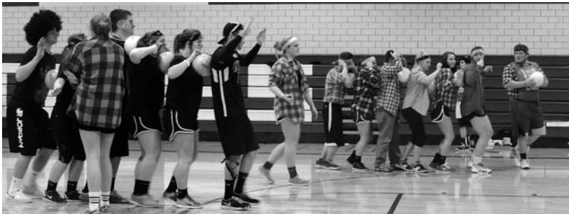
Seniors and juniors go head-to-head at Ball Trolley. The seniors came out on top to win the competition.