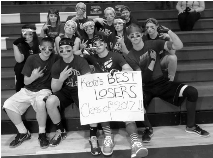
The Sophomores are proudly displaying their sign "Keota's Best Losers of 2015."