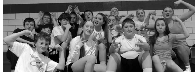
8th graders are ready to take on Anything Goes.