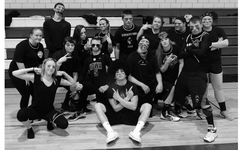
The juniors show off their black out theme.