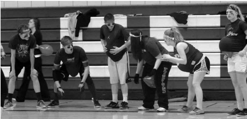
Sophomores are getting ready to pop the balloons during the Balloon Burst challenge.