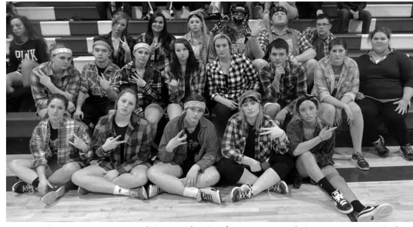
Seniors were rocking their last Anything Goes night.