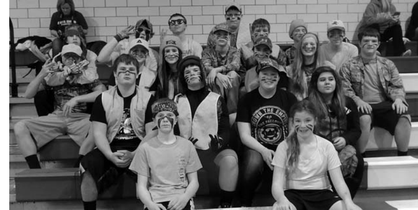
Freshmen are pulling off the camo at Anything Goes.