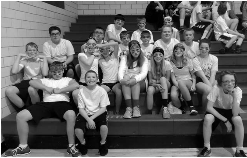
The 7th graders are being innocent in their all white at Anything Goes on January 15.