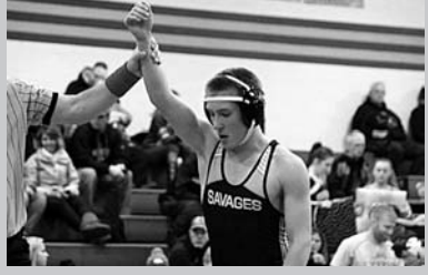
That's a win!