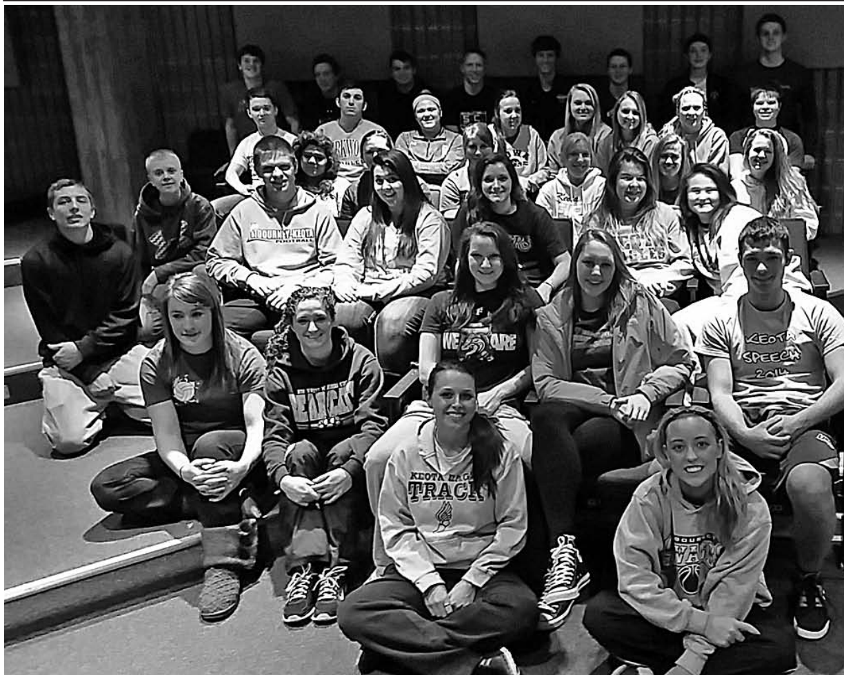
Pictured are the 2015 KHS Speech students. All groups turned in Division I ratings overall at State Contest on Feb. 7.

On Sat., Feb. 7, Keota Large Group Speech performed at State Speech Contest at Cedar Rapids-Washington. After receiving Division I ratings two weeks prior at Districts, all groups advanced to State. All groups once again turned in top notch performances at State, and everyone went home with Division I ratings as well.