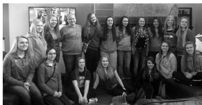
Above: The EagleRock! girls gather for a photo in the hotel.