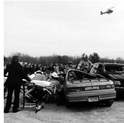
The University of Iowa Air Care flies into the scene.