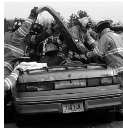
Keota and Sigourney Fire Departments cut the top of the car off to get the mock victim out (played by Cole Stout) safely.