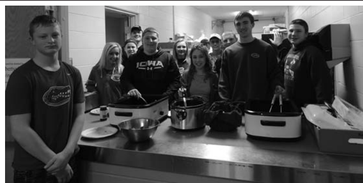
FFA members helped prepare and serve the FFA Faculty Breakfast to show their appreciation for staff members on Wednesday, Feb. 21.