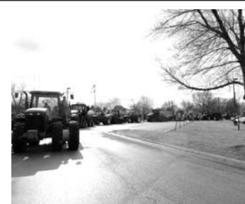
Seventeen students drove their tractors to school on Friday, Feb. 23 for the annual FFA Tractor Day.