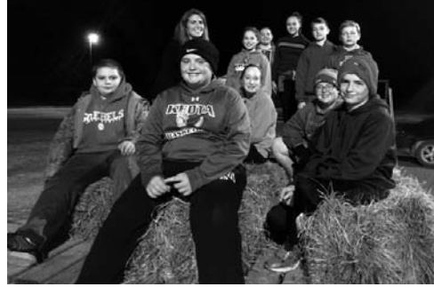
Pictured above and below are the FFA students getting ready to take off on the annual Keota FFA Hayrack Ride and Bonfire on Wednesday, Oct. 11.