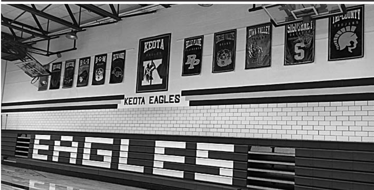
The Keota Athletic Boosters have been hard at work this year with many projects geared towards updating and beautifying the school facilities. The Athletic Boosters recently donated and installed new SICL banners to replace the old ones in the High School Gym. The school appreciates all the hard work put in and support received from this organization.