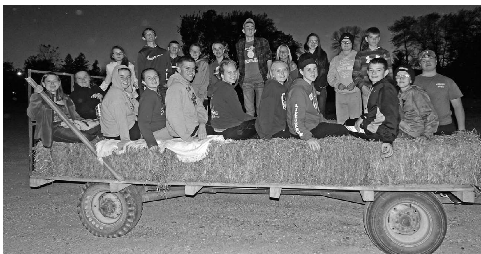
The Keota Junior and Senior High FFA Members gathered on Wed., Oct. 14 for their annual hayride and bonfire. This is an annual event held to kick off the new school year. A fun evening was enjoyed by all.