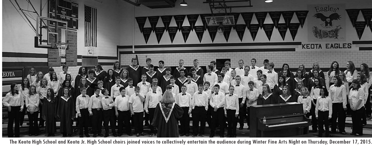
The Keota High School and Keota Jr. High School choirs joined voices to collectively entertain the audience during Winter Fine Arts Night on Thursday, December 17, 2015.