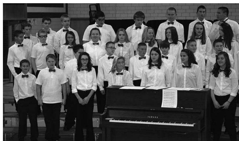
Pictured is the Keota Jr. High School Choir getting ready to perform at Fine Arts Night on December 17.