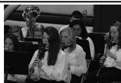
Keota Jr. High and High School clarinetists shared their talents during Fine Arts Night on December 17.