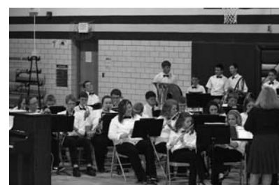
The Keota High School and Keota Jr. High School bands joined together to display their talents during Fine Arts Night on Thursday, December 17, 2015.