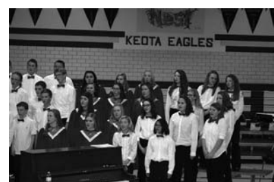
The Keota High School and Jr. High School choirs sang a couple of pieces as a large group during the evening.