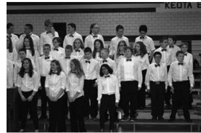
Above, the Keota Jr. High School choir prepares to entertain the crowd with their musical talents.