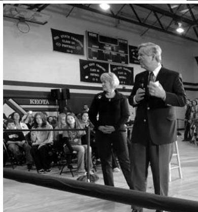
Tom and Christie Vilsack speak to the crowd.