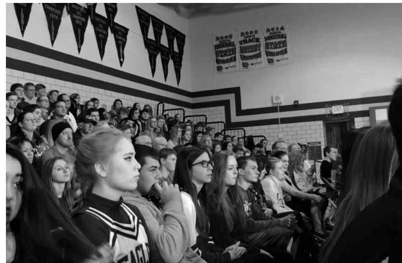
Students look on as former Secretary of State and First Lady Hillary Clinton speaks to a packed KHS gym.