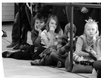
Keota Elementary students wait patiently for Secretary Clinton to take the stage.