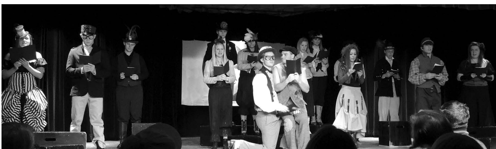
The Keota High School Speech Team held Home Presentations on Wed., Jan. 20, in the KHS auditorium. Pictured above is the Choral Reading group performing "Hammer in his Hands." The evening included performances by all of the groups that will be competing at Districts in Pella on Sat., Jan. 23. Watch next week's Eagle's Wing for more pictures of all the performing groups, as well as results from District Speech Contest.