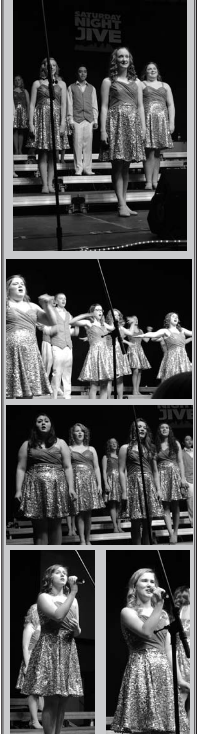
EagleRock! Show Choir kicked off the 2016 season at West Branch on Sat., Jan. 16. The group put on a fabulous show and came home with a 2nd place trophy. Be sure and catch them at home when they perform at the State Show Choir Competition to be held in the Keota High School gymnasium on Mon., Feb. 1st.