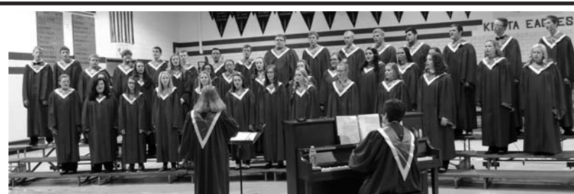
The Keota High School Chorus sang "Seasons of Love," "Going Up to Bethlehem," and "Na, Na, Na" at the Winter Fine Arts Concert.