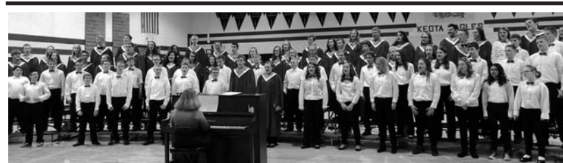
The Keota Jr./Sr. High School Winter Fine Arts Night was held on Thursday, December 15. Pictured above are the Junior and Senior High choirs combining to sing "Mistletoe."