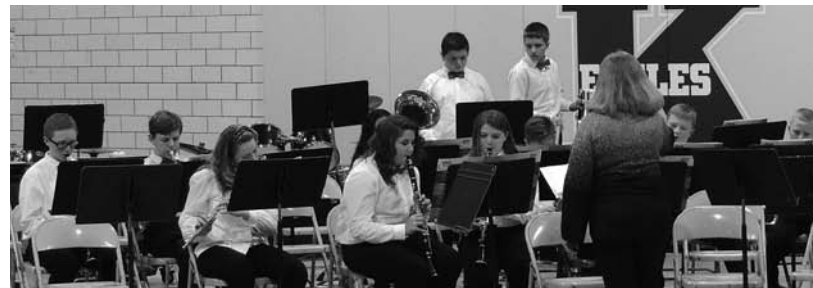
The Junior High Band performed "March of the Hyperion Guards" and "Drama for Your Mama."