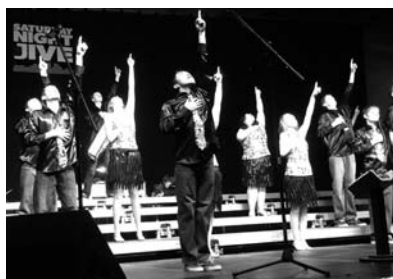
Pictured above is a group picture of EagleRock! performing at Saturday Night Jive in West Branch.