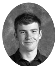
"1970 CHEVY CHEVELLE SS"