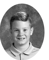
"2017 AUDI R8"