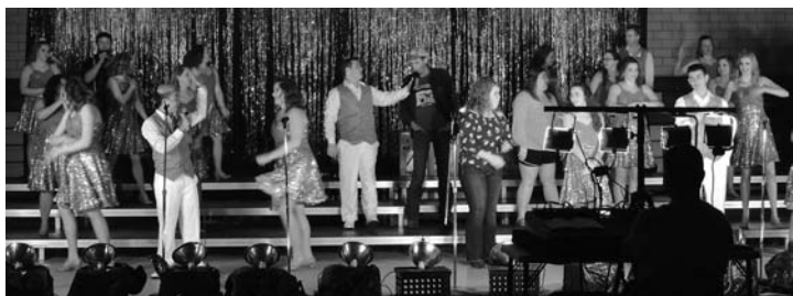
The group invited past EagleRock members to come on stage and do the traditional dance to "Taking Care of Business."

Don't worry, however, as you can still catch ER! one more time. They will be performing at their annual Pancake Breakfast on Saturday, June 3. You can swing by and stuff your face with pancakes, and then enjoy some catchy tunes!