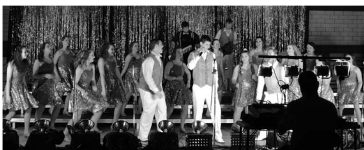
EagleRock brought all their energy to the stage in their final performance of the school year on Wednesday, April 25.