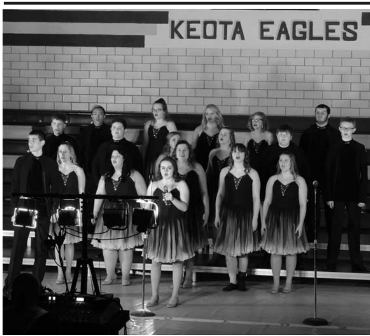
EagleRock! sings their ballad "Dream Small" at the Winter Fine Arts Night on Thursday, December 13, 2018.