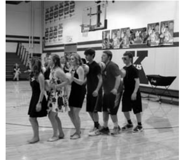
The seniors get ready for the Ball Trolley during Anything Goes.