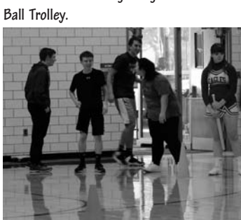
The juniors get ready to play a friendly game of Homer Head during Anything Goes.