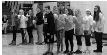
The junior high gets ready to do the Ball Trolley during Anything Goes.