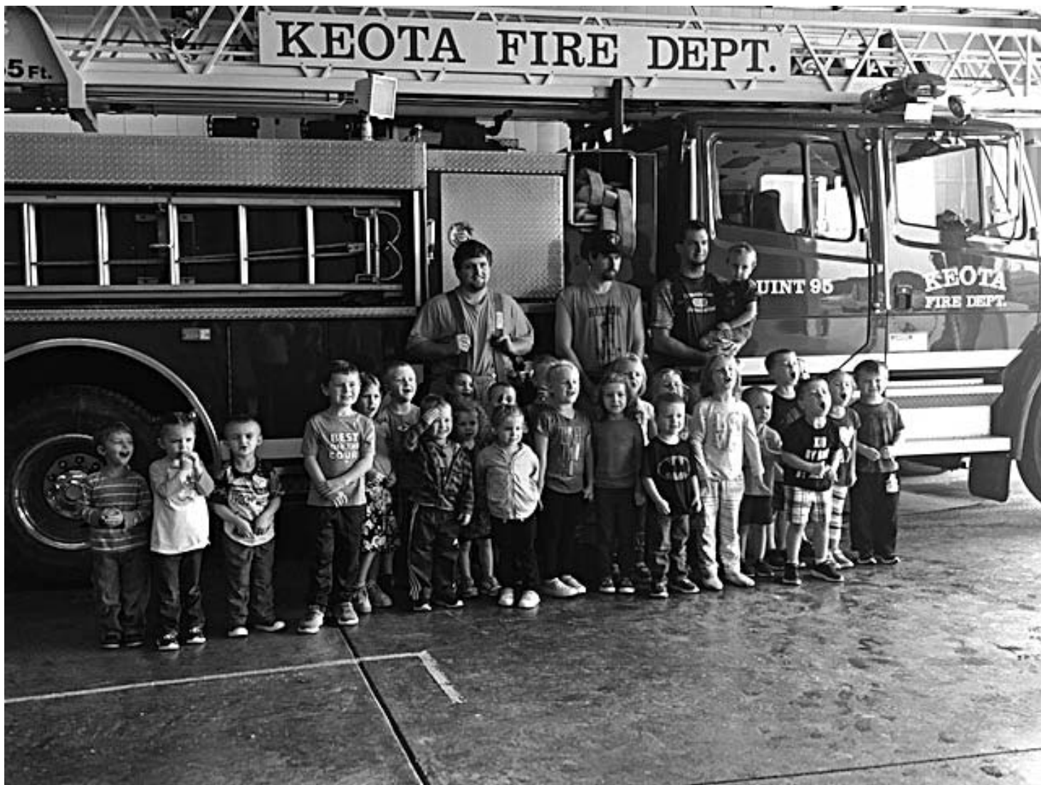
Keota preschoolers pose with a fire truck on their field trip to the Keota Fire Station during Fire Prevention Week.

The firemen in Keota do such great things for the students at the Keota Elementary School. Every year during Fire Prevention Week, the firemen take a few students to school in a fire truck and they educate students on what to do during a fire and how to