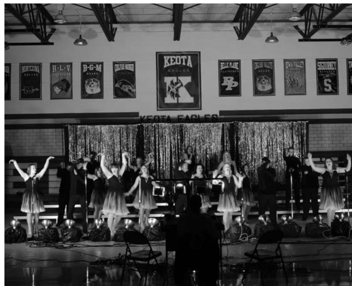
EagleRock! rocked the house with their first song of the night, "Faith" by George Michael.