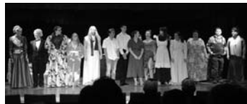
The cast of "Unmurdered" takes a bow after Thursday's performance.