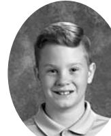
"A FOOTBALL PLAYER"