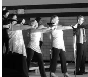
EagleRock! members kicked off the evening with a dazzling performance.